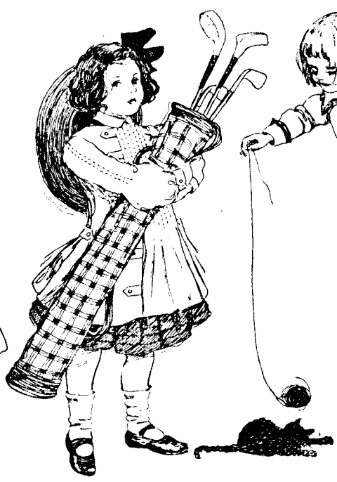
LIGHT CLOTH COAT