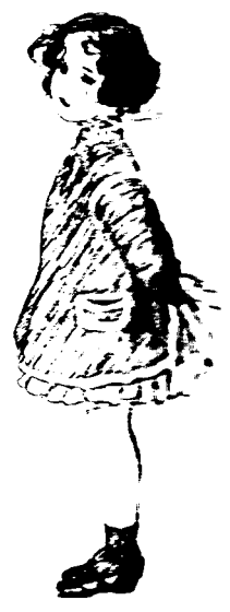
A PLAID FROCK