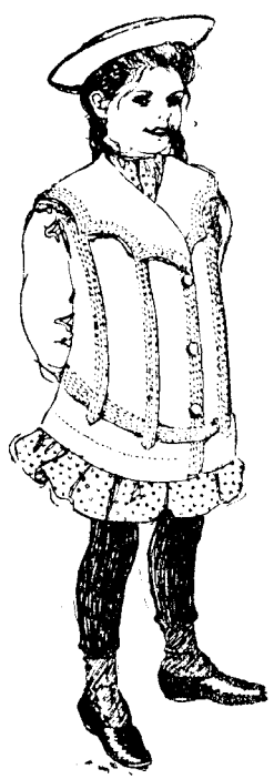
A SPRING COAT